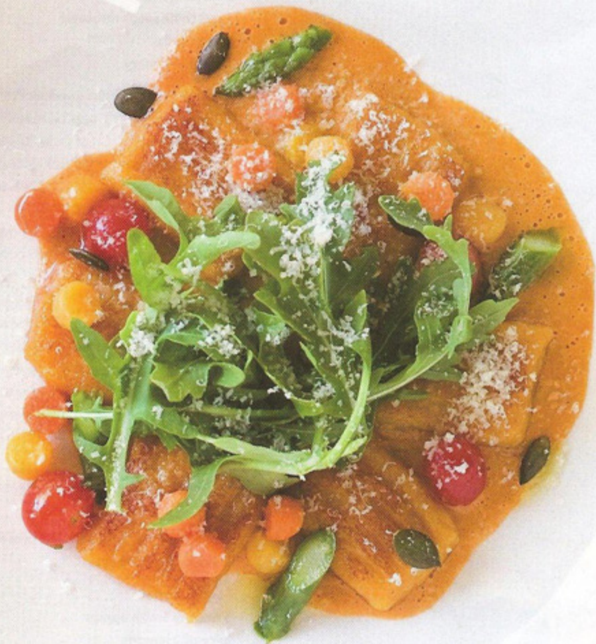
BUTTERNUT GNOCCHI WITH FRESH-TOMATO COULIS

“MORE IMPORTANT TO ME IS THE PRECISION OF THE COOKING AND THE USE OF SIMPLE, LOCAL INGREDIENTS”