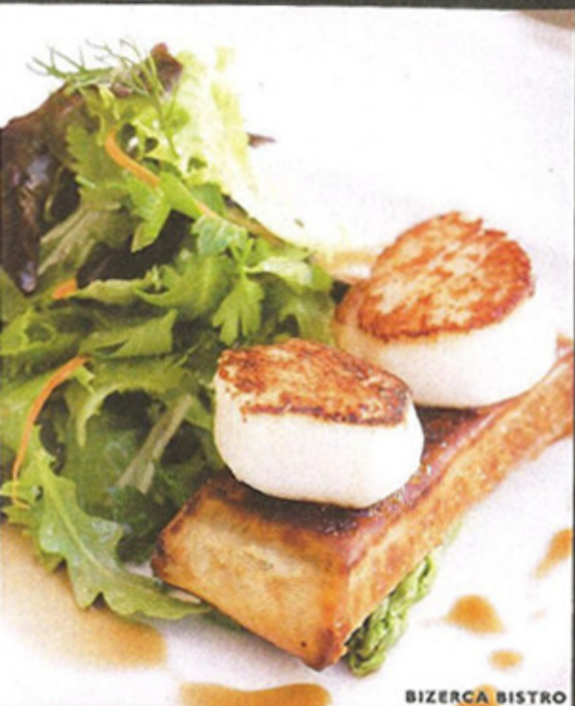
BIZERCA BISTRO BIZERCA BISTRO